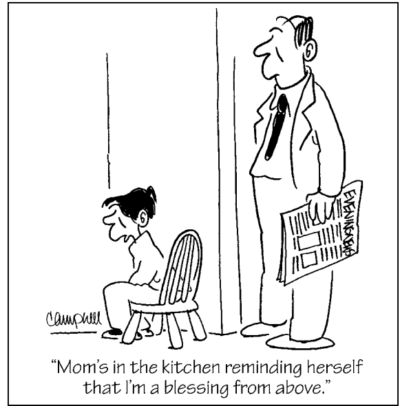
Used with permission - The Newsletter – April 2000

Zephaniah Zechariah Haggi Jonah Habakkuk Nahum Hosea Joel Malachi Obadiah Amos Micah